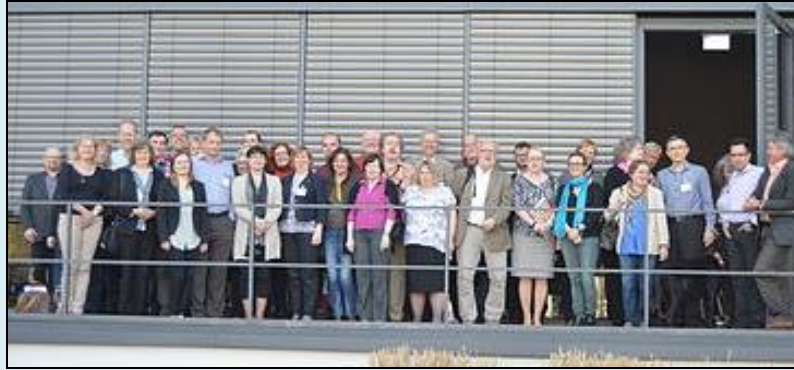
Participants at EFHOH AGM and Conference 2015

The highlight of the EFHOH General Meeting was the signing of the Essen Declaration 2015 on April 10, 2015. The Declaration's theme is Access to hearing aids is access to opportunity . It sends a powerful message to decision makers in the European Union. Austerity measures affecting Member States are raising concerns, and in some cases are having a negative impact on the provision of hearing aids and assistive listening devices. The basic principle of the Declaration is: "No one should be priced out of equal opportunity." You can download and print the full content of the Declaration by clicking this link: Essen Declaration Text .