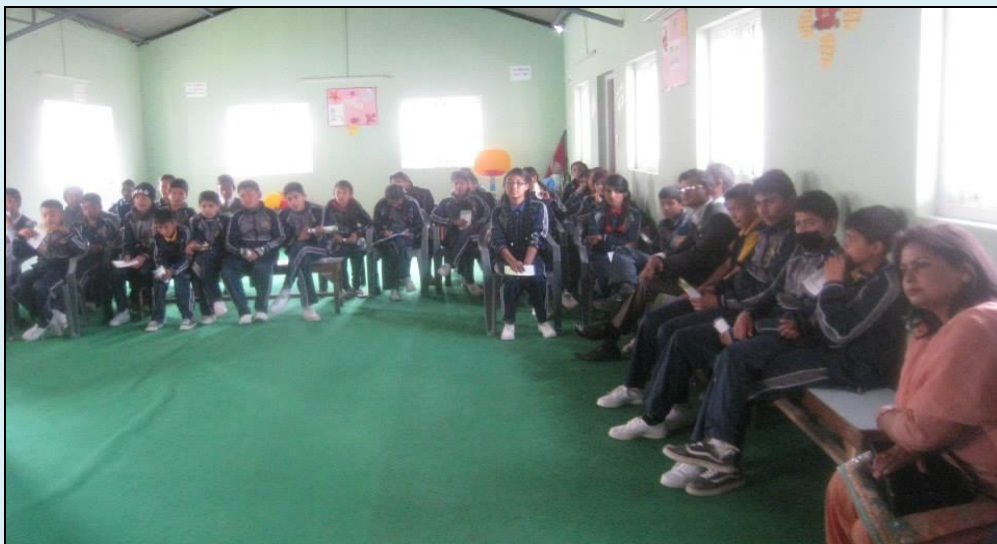
High school teenagers and their teacher at Baluwakhani, Kapan, Reliance Co-education