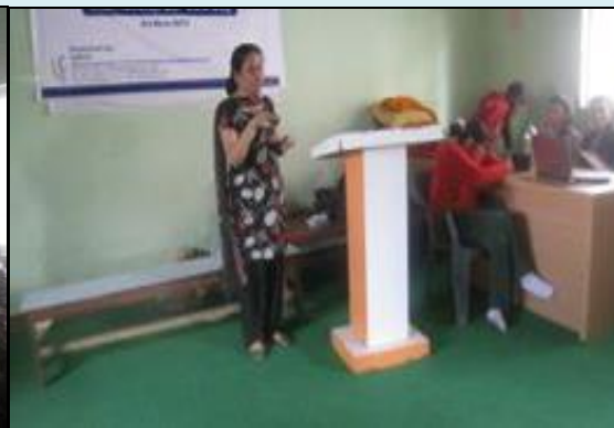
Speaker explaining how to make listening safe