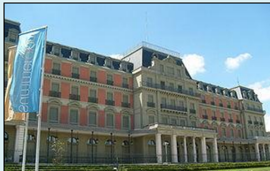
The 13th Session of the UN Committee on the CRPD, was held at the Palais Wilson, United Nations, Geneva, Switzerland