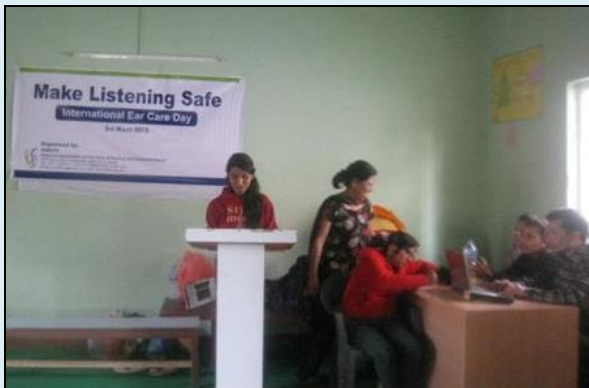
Welcome Speech by SHRUTI General Secretary

SHRUTI had celebrated International Ear Care Day 2015 by meeting with young people at Baluwakhani, Kapan, Reliance Co-education high school to explain how to avoid noise-induced hearing loss. Here are some photos of the event: